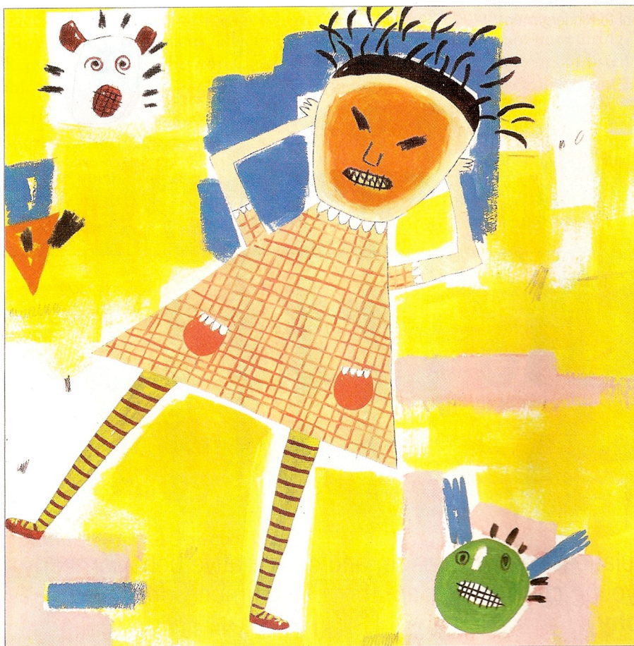
Yumi Heo's collage illustrations capture the furious energy of a child's tantrum in Rachel Vail's Sometimes I'm Bombaloo .